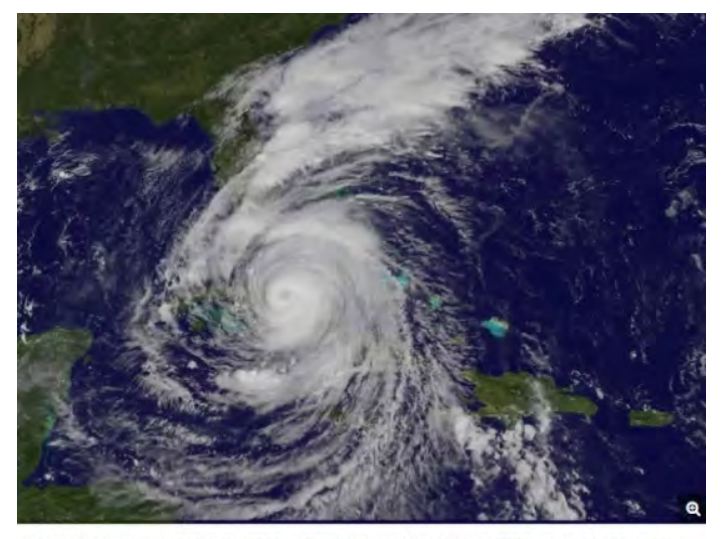
The National Oceanic and Atmospheric Administration's GOES East satellite captured this visible image of Hurricane Irma at 10:37 a.m. EDT on Saturday (Sept. 9) when it was a Category 4 storm.

Category 5. And this September in the Atlantic we have had Hurricane Harvey (Category 4) and Hurricane Irma (Category 5) to date. As you read this article Hurricane Jose and Hurricane Maria are underway. From a probability and impact perspective one could argue Hurricanes are moving up the threat list as they seem to be occurring more frequently.